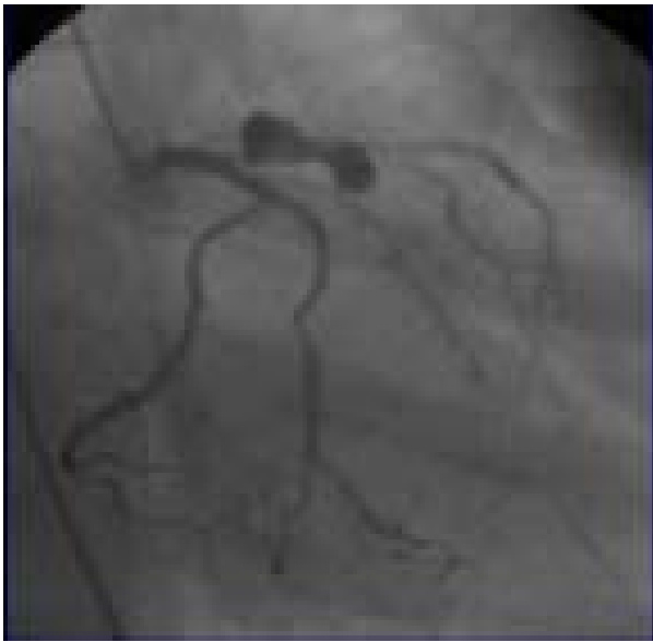
Figure 2 : Aneurysm developing 6 months after implantation of DES

aneurysms may develop and at times these may leak and cause tamponade (Figure 2 & 3)