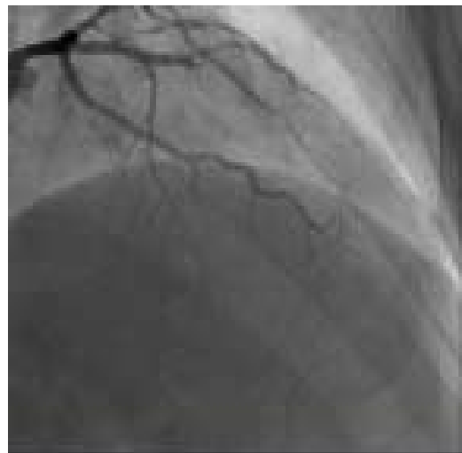
Figure 1 : Left coronary angiogram showing abrupt cutoff at inflow of the Cypher stent implanted 22 months ago. The patient at this time was on aspirin and this time subject to thrombus extraction and PCI

2003 in the USA, are the Sirolimus eluting Cypher (Cordis, J&J) and paclitaxel eluting Taxus (Boston Scientific) and much data available today pertains to these two stents . Several randomized studies have proven the efficacy of both these stents upto a follow up period of 4 to 5 years. A new problem that seems to have cropped up with the use of DES is stent thrombosis especially late and very late stent thrombosis (Figure 1). Stent thrombosis can be classified as acute, subacute, late and very late when