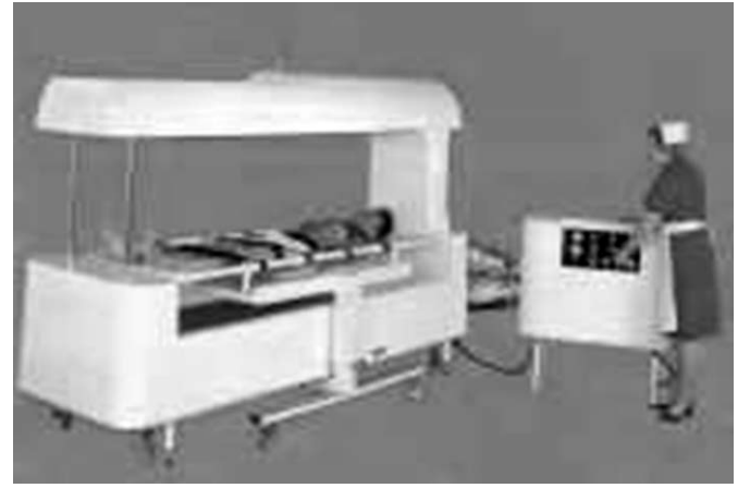
Figure 1 : Body cooling unit for treatment of heatstroke.

Ventricular fibrillation Disseminated intravascular coagulation Hepatic failure Pulmonary edema Renal failure Rhabdomyolysis