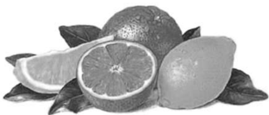
Figure 1 : Nature is chiral

Our hands and feet are chiral - the right is a mirror image of the left and not superimposable.