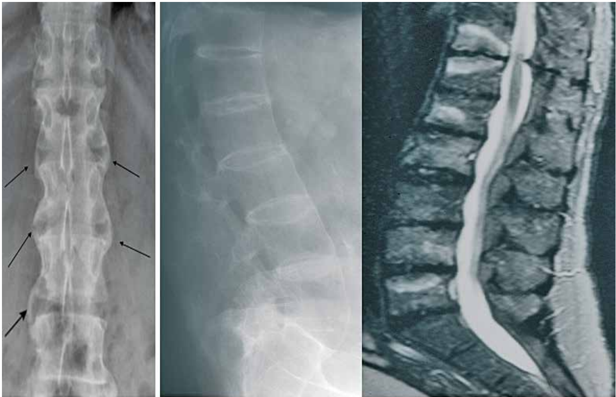
Fig. 1: X-ray of patient with AS showing Syndesmophytes (arrows) (left) and middle resulting in bamboo spine. Right sided T2 weighted MRI image showing spondylitis and spondylodiscitis